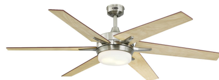
Reversible Light Maple Finish Blades